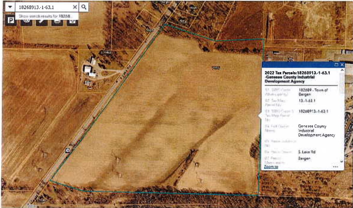
EXHIBIT A Tax Map of Property