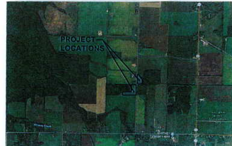
LOCATION MAP W/ AERIAL NTS

GATEWAY - PLUG POWER HYDROGEN PRODUCTION FACILITY SITE