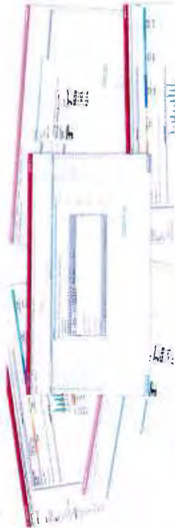
Features of the Fission CMS included in the standard package are:

The website will be built on the powerful content management system called Fission; built, deployed, and supported by 360 PSG. The platform was created with modern web standards and browser capabilities in mind (including search engine optimization fundamentals, mobile device views, and more). This system also includes over 100 tools, widgets, and components for you to manage your own website's content in a simple way. Genesee County Economic Development Center can log in at anytime to add content, update the site, or change information in real-time. All without having to pay each time for service charges or even have people with web design experience in-house. Fission is the best option available to create a site that needs all the basics today but the capability to grow with you for years.