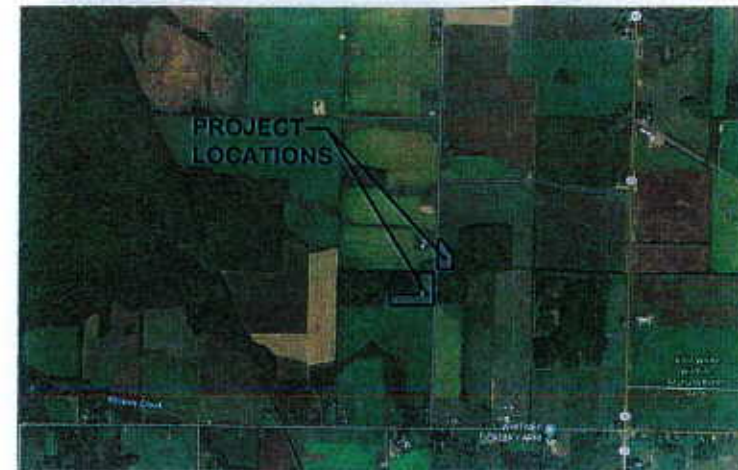
LOCATION MAP W/ AERIAL NTS

GATEWAY - PLUG POWER HYDROGEN PRODUCTION FACILITY SITE