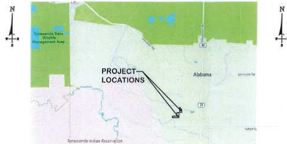
LOCATION MAP NTS